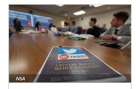
Next Generation of Intelligence Analysts Presents Research on Foreign Social Media Campaigns