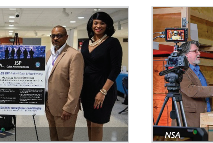
DISA Joint Service Provider Hosts Cyber Awareness Forum With Government and Industry

KM & Information Sharing; Software Data & Analysis